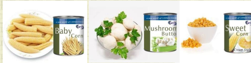
Canned Baby Corn Canned Mushroom Button Canned Sweet Corn