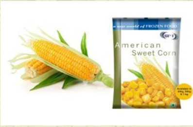
Frozen Sweet Corn