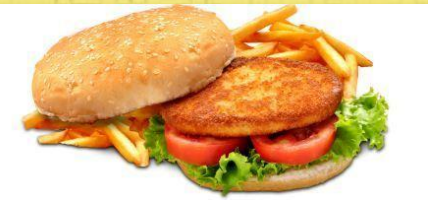
Frozen Veggie Burger Tikki