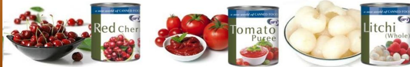
Canned Red Cheery Canned Tomato Puree Canned Litchi Whole