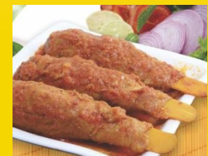
Frozen Soya Chap