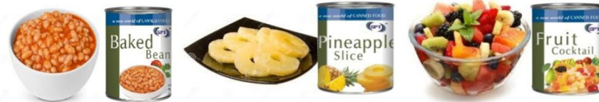
Canned Baked Beans Canned Pineapple Slice Canned Fruit Cocktail