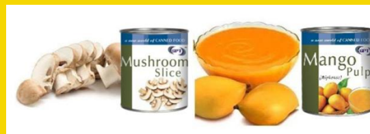
Canned Baby Corn Canned Mushroom Button Canned Sweet Corn